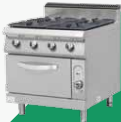
4 OPEN BURNER WITH OVEN