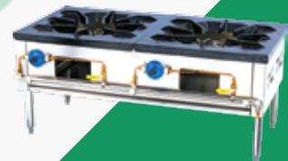
DOUBLE STOCK POT