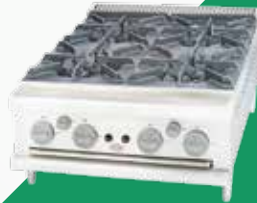
4 OPEN BURNER