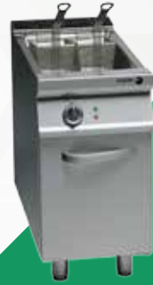
DEEP FRYER (FLOOR STANDING)