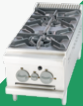
2 OPEN BURNER