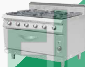
6 OPEN BURNER WITH OVEN